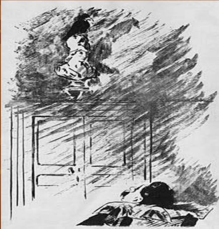
Illustration by French impressionist Édouard Manet