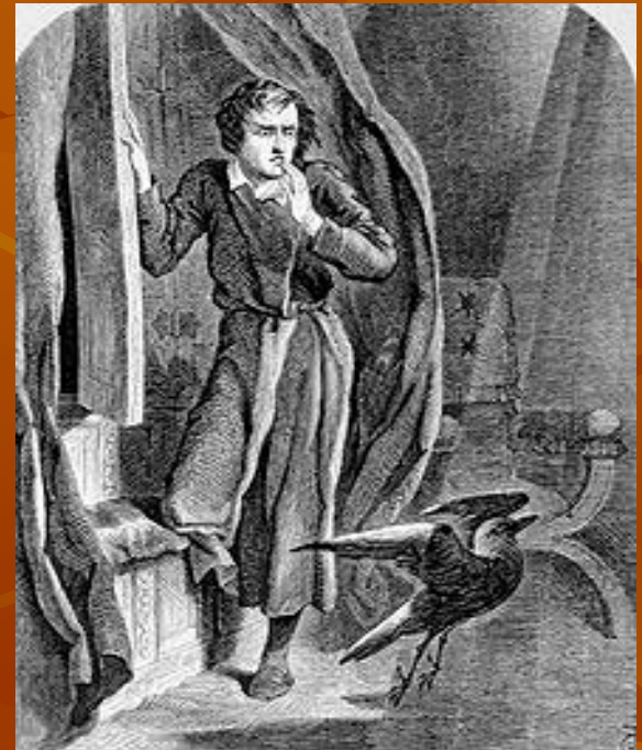
illustration by John Tenniel (1858)