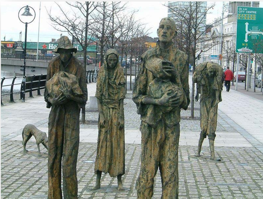
The Great Famine Memorial in Dublin

The Factory Acts improved conditions of workers, e.g. cut down working hours for women and children to 10 hours a day.