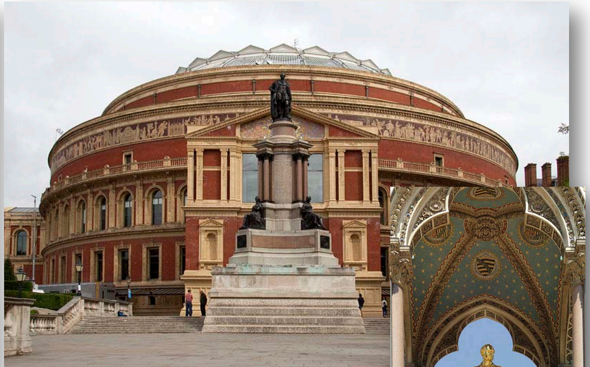
Royal Albert Hall