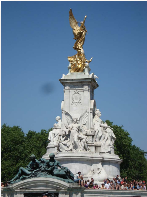
The Victoria Memorial in front of Buckingham Palace