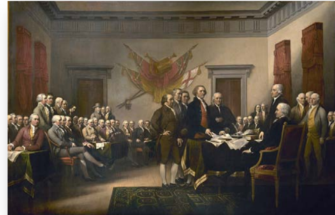
The Second Continental Congress in Philadelphia